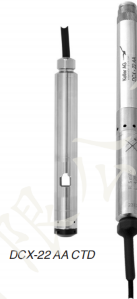
DCX-22 AA CTD

The DCX-22 SG/VG CTD versions have a cable outlet, negating the need to withdraw the instrument from the immersion tube in order to read out the data. A locking disc is used to secure the interface connector at the surface. In the VG version (reference pressure measurement), the reference equalisation capillary tube in the cable is inserted into the upper housing (read-out connector), where the reference opening protected by a Gore-Tex® diaphragm is located.