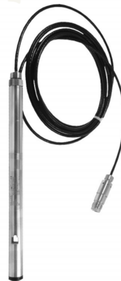
DCX-22 SG CTD DCX-22 VG CTD